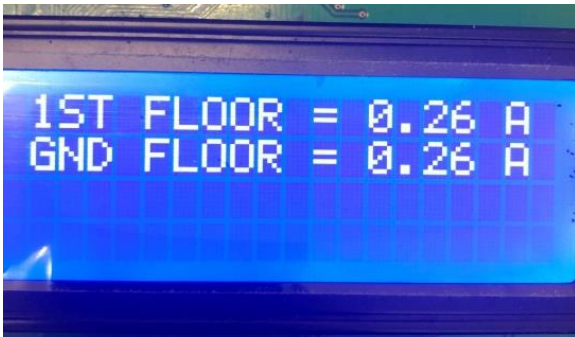
Figure 4. Current reading (A) when relay switch is on

Figure 4 shows the LCD display of current reading when the relay is switch off at the ground (GND) floor and the 1st floor. For example, the ground floor is connected with water heater and the 1st floor is connected with multicooker. As can be seen, both of the reading displayed 0.26 A when the relay switch is turned off. If the reading is below 0.30 A, that indicate the relay switch is turn off and no load is connected. After the relay switch is turn on, LCD will display the current usage of multicooker on the first floor and current usage of water heater on the ground floor as in Figure 5.