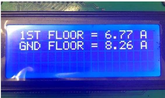
Figure 5. Current reading (A) when relay switch is off

The relay breaker system was built with single purpose which is to disconnect undesired load in the house at one central switch. Therefore, the result was recorded to present functionality of the relay breaker system through circuit indication with two condition switches and relay module as shown in the Figure 6. When the relay module only indicates green LED that means the relay switch is in off mode.