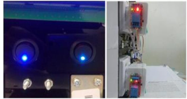
Figure 7. Condition of relay breaker System while triggered (received signal)

green LED meaning that the relay switch is in on mode and trigger the relay module. When the relay switch is turned on, there is no current flow towards the load.