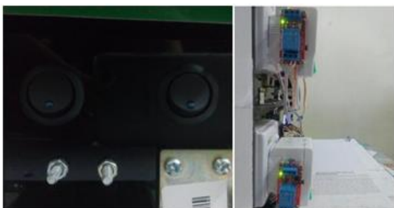
Figure 6. Condition of relay breaker system when is not trigger (non-receive signal)

The relay breaker system was built with single purpose which is to disconnect undesired load in the house at one central switch. Therefore, the result was recorded to present functionality of the relay breaker system through circuit indication with two condition switches and relay module as shown in the Figure 6. When the relay module only indicates green LED that means the relay switch is in off mode.