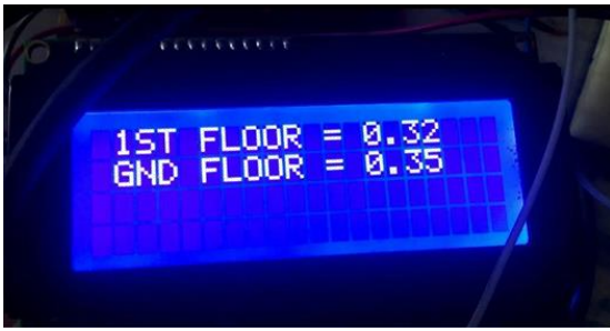
Figure 2. Double input reading use 4x20 LCD

successful configuration, it automatically pairing with each other by switching off and re-connect again supply to module.